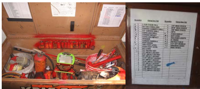
1 of 4 two man gang boxes

Working on the road requires a similar mind set. Shut downs are critical to get in and get out as efficiently as possible. Lack of specialized equipment and tools will wreak havoc on a job's productivity. This can be costly to our Customer, and our company. By using simple organization and inventory methods our 'road warriors' know what they have...and what they need.