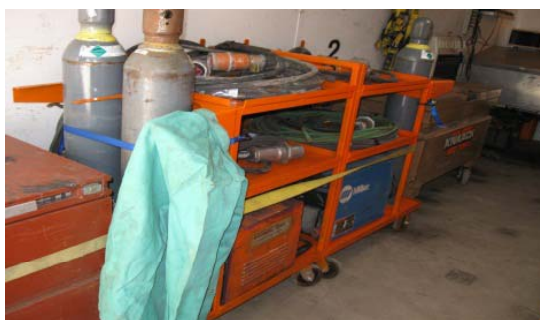
Two welding carts fully stocked with gas, wire, hose, lead, stinger, ground, gauges, gloves, grinder etc. (left).

A couple of Road Warriors, pictured below