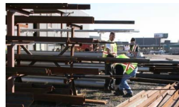
Before Saw Container Move 5S Event