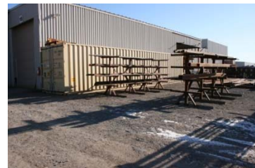
After Saw Container Move 5S Event