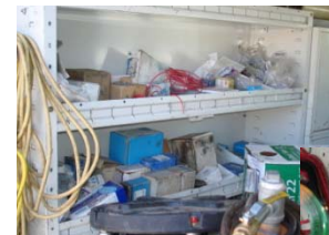
Left: Service Van Before 5S Event